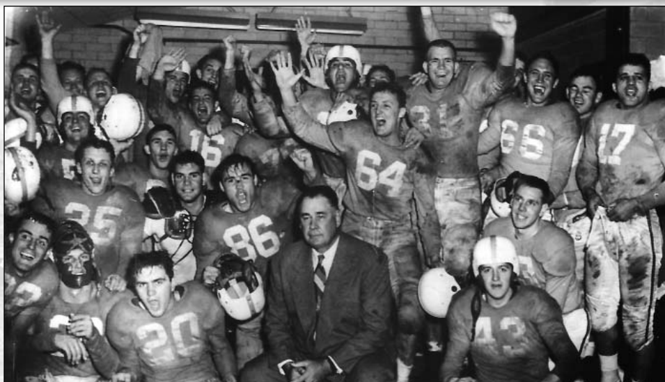
NEYLAND, THE PSYCHOLOGIST: Neyland is shown in the dressing room with the Vols after the 1951 Cotton Bowl triumph over Texas.

In 2002, Fulmer notched his 100th career victory, and like many other milestones, the number of victories takes on an exceptional glow when held up to the light of gridiron